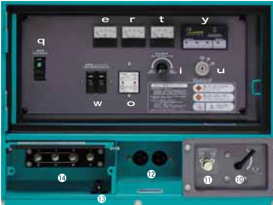
TLG-13ESY • 18ESY

q Circuit Breaker(Three Phase Output) w Circuit Breaker(Output Socket) e Frequency Meter r AC Ammeter t AC Voltmeter y Engine Monitor u Starter Switch i Voltage Regulator o Earth Leakage Relay 10 Adjustable Speed Lever 11 Adjustable Frequency Screw 12 Single-phase Output Socket (2 x 15A) 13 Ground Terminal (For Bonnet) 14 Three Phase Output Terminals