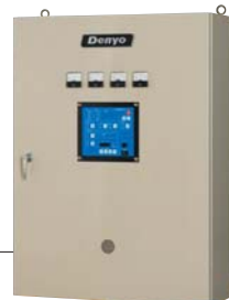
The hanging automatic start panel

Connecting the optional automatic start panel enables use as an emergency backup system, only if the generator has had the appropriate modifications.