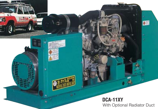
DCA-11XY With Optional Radiator Duct

Lightweight and compact dimensions make XY series units ideal for ambulance, remote telecast van and similar vehicle applications.